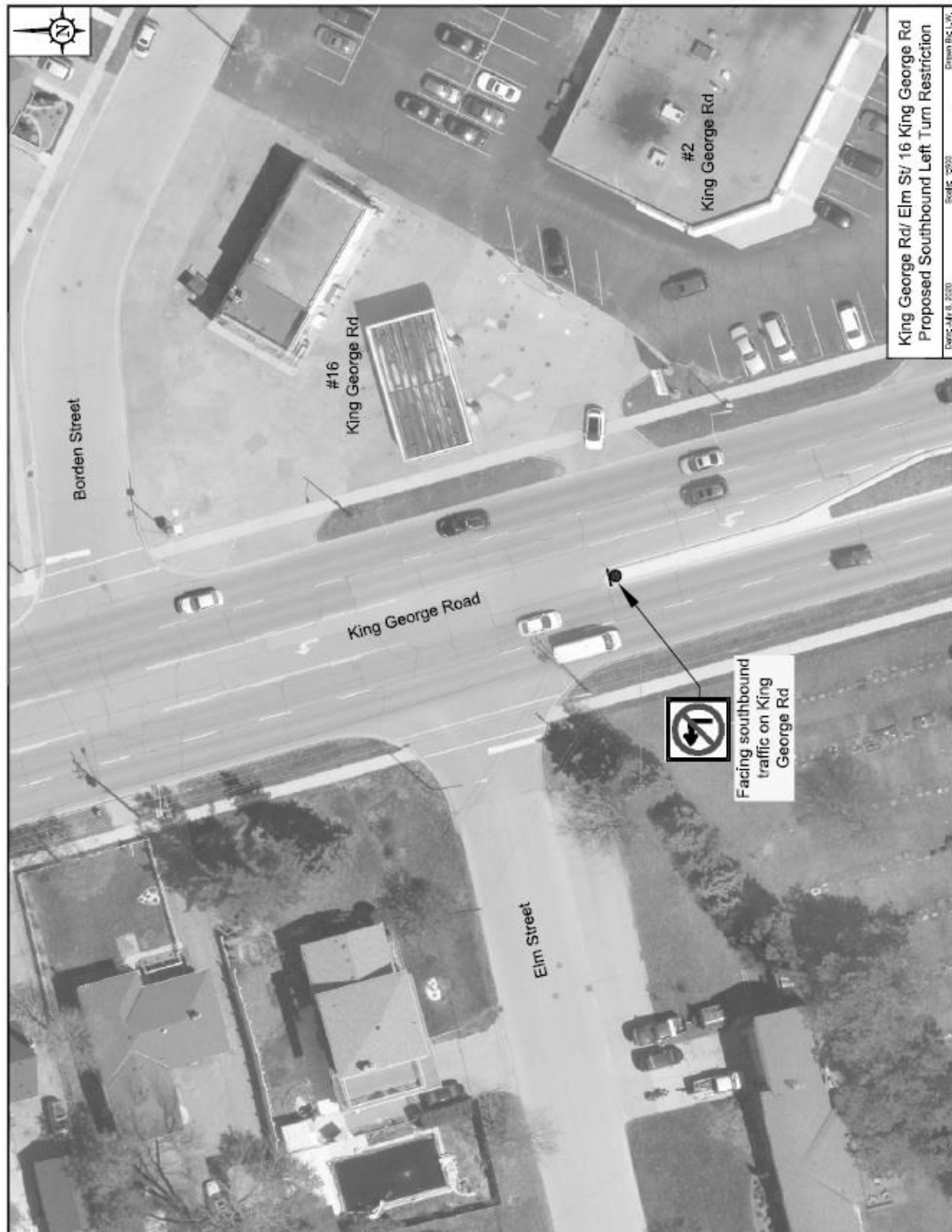
Figure 1 - King George Road at 16 King George Road - No Left Turn