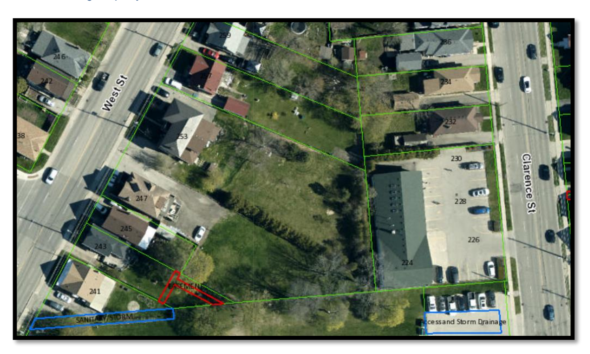
Figure 1-Aerial of Existing Property

The City of Brantford has received a Site Plan Amendment Application for the lands located at 247-253 West Street. The subject property is located on the east side of West Street, approximately 200 meters south of the intersection of West Street and Clarance Street. The proposed development is a three-storey apartment building with 18 units, and 24 parking spaces. Primary access to the property will be from West Street. Relevant visual documentation includes Figure 1 , an aerial of the subject lands; Figure 2 , a street view of the existing site; and Figure 3 , a concept plan showing the proposed apartment building. A full-sized version of the concept plan is attached as Appendix A .