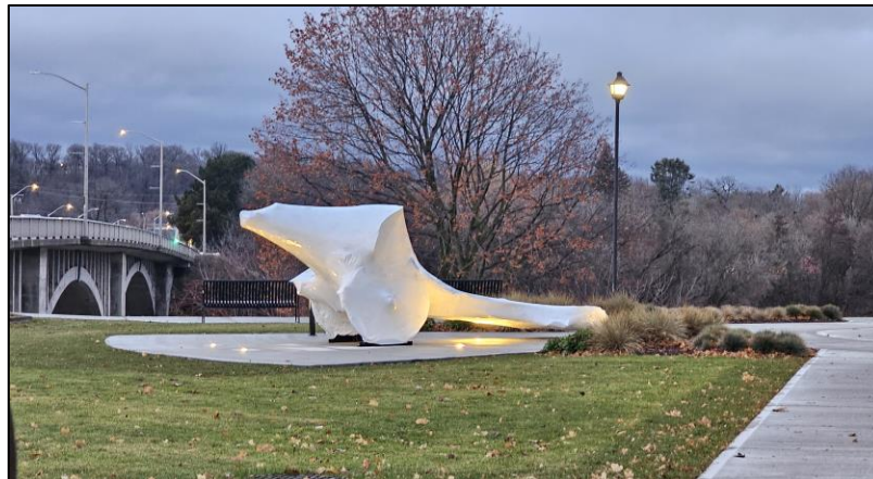
Figure 1 German Field Howitzer wrapped in a protective covering.

City Staff in consultation with the Canadian Military Heritage Museum (CMHM), recommend that the German Field Howitzer (“Cannon”) be relocated indoors at the CMHM to prevent further deterioration and stabilization of the war trophy.