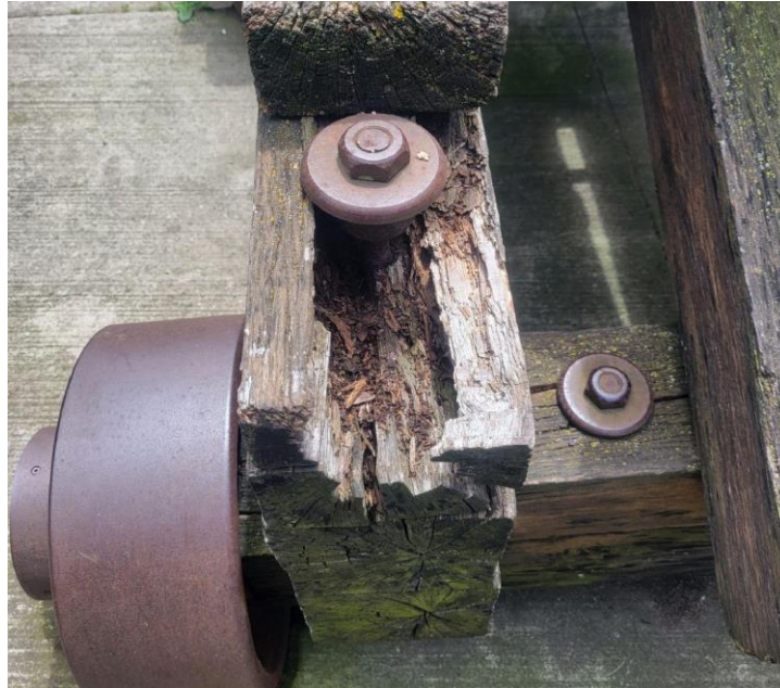
Figure 2 Rot on the wooden base of the Alexandra Park Cannon due to outdoor exposure.

The Public Art Subcommittee met on January 6, 2025 and approved the relocation of the Alexandra Park Cannon to the Canadian Military Heritage Museum. The PAS also approved and recommends the deaccessioning of the cannon from the public art collection.