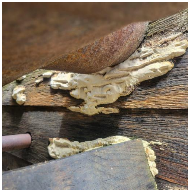
Figure 3: Fungi growing on the wooden carriage of the Alexandra Park Cannon.

In addition to the relocation of the cannon, staff recommend a new public art piece be installed in place of the Alexandra Park Cannons. Staff will