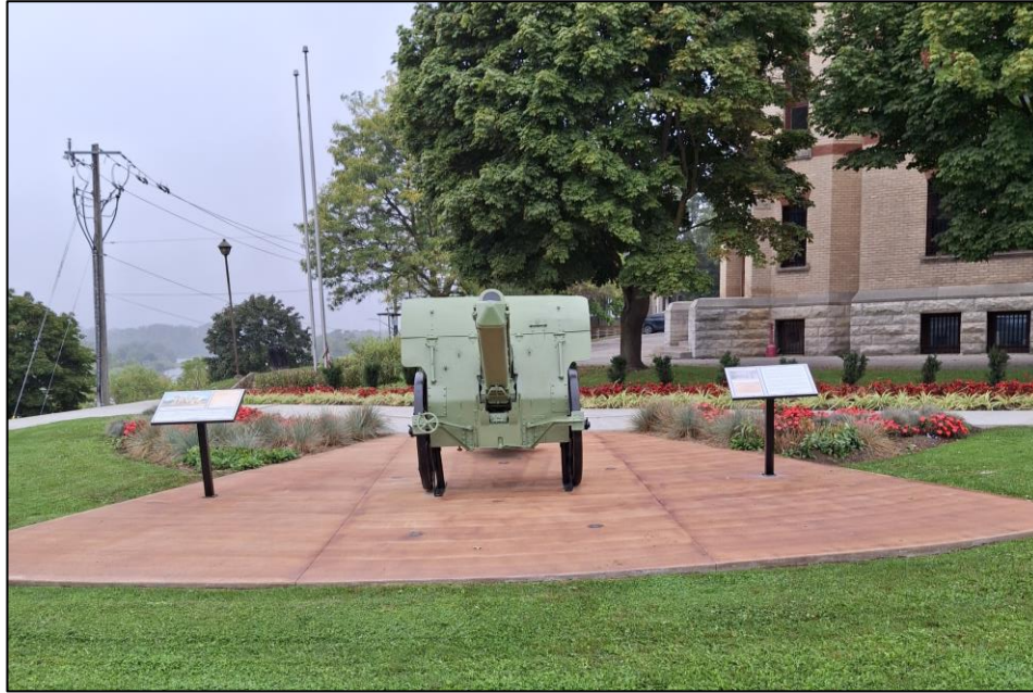
Figure 5: The two storyboards installed on either side of the German Field Howitzer Cannon in Jubilee Terrace Park.