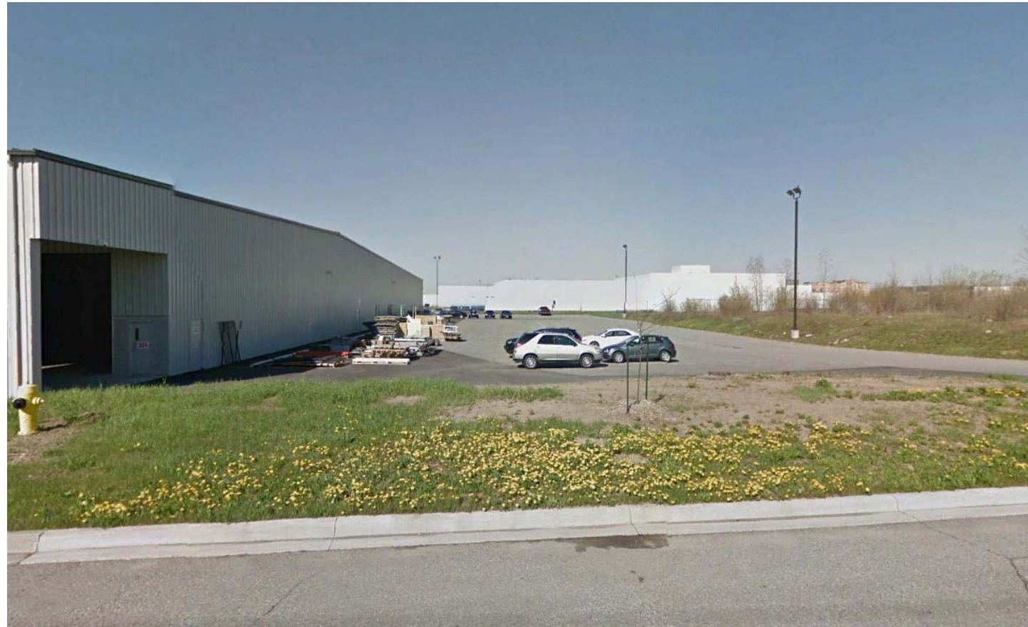
View from Savannah Oaks Drive looking South towards proposed Signum tower.