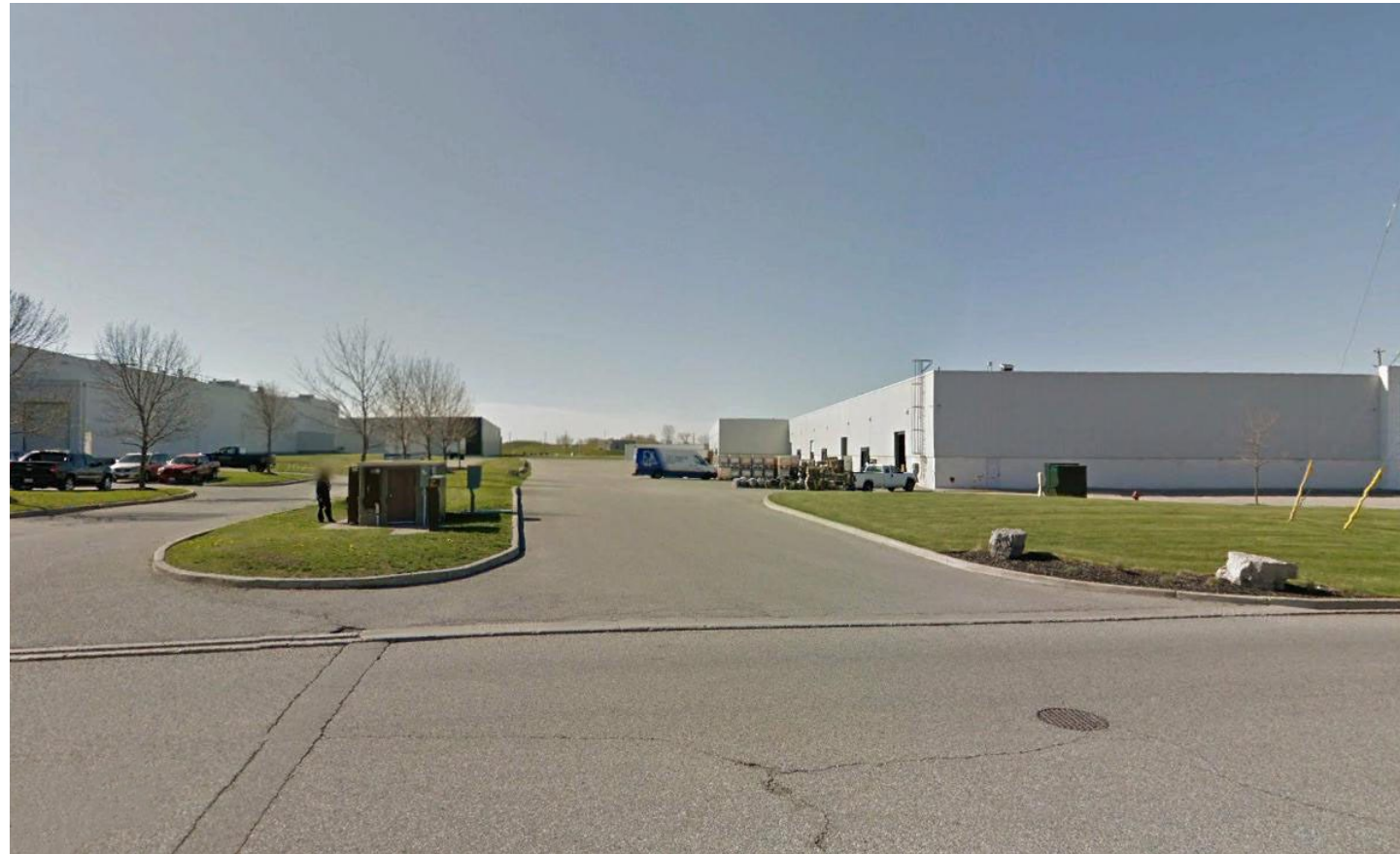
View from Savannah Oaks Drive looking South towards proposed Signum tower.