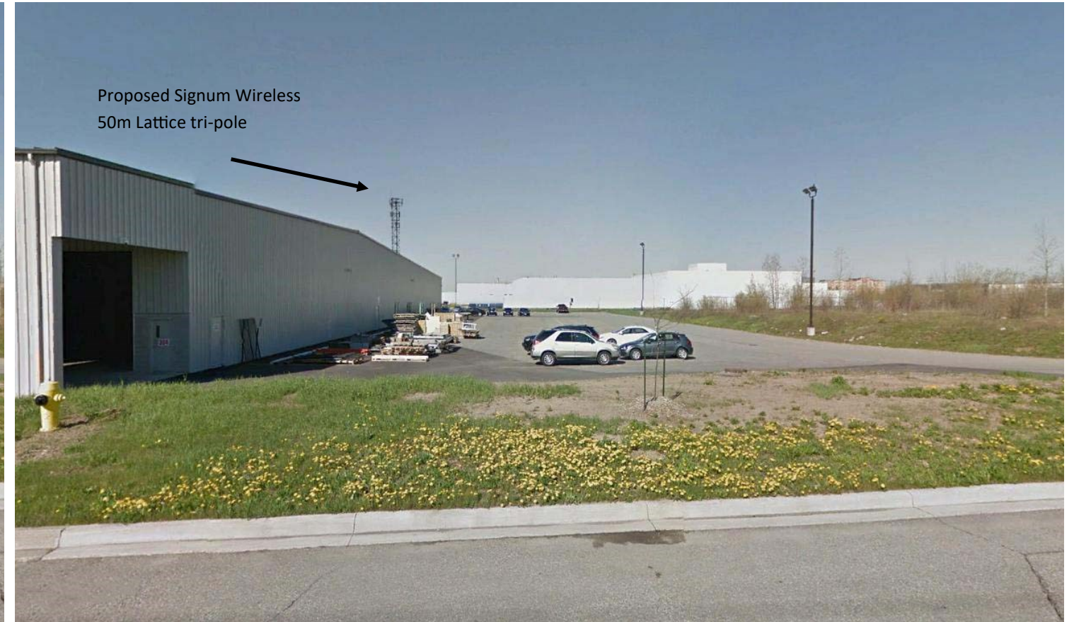
Proposed lattice tripole tower shown at approximately 50.0 metres in height. The photo simulation is based on information provided by Signum prior to construction. The photograph location is approximately 331 metres from tower location.

PHOTOGRAPHIC SIMULATION BEFORE AND AFTER