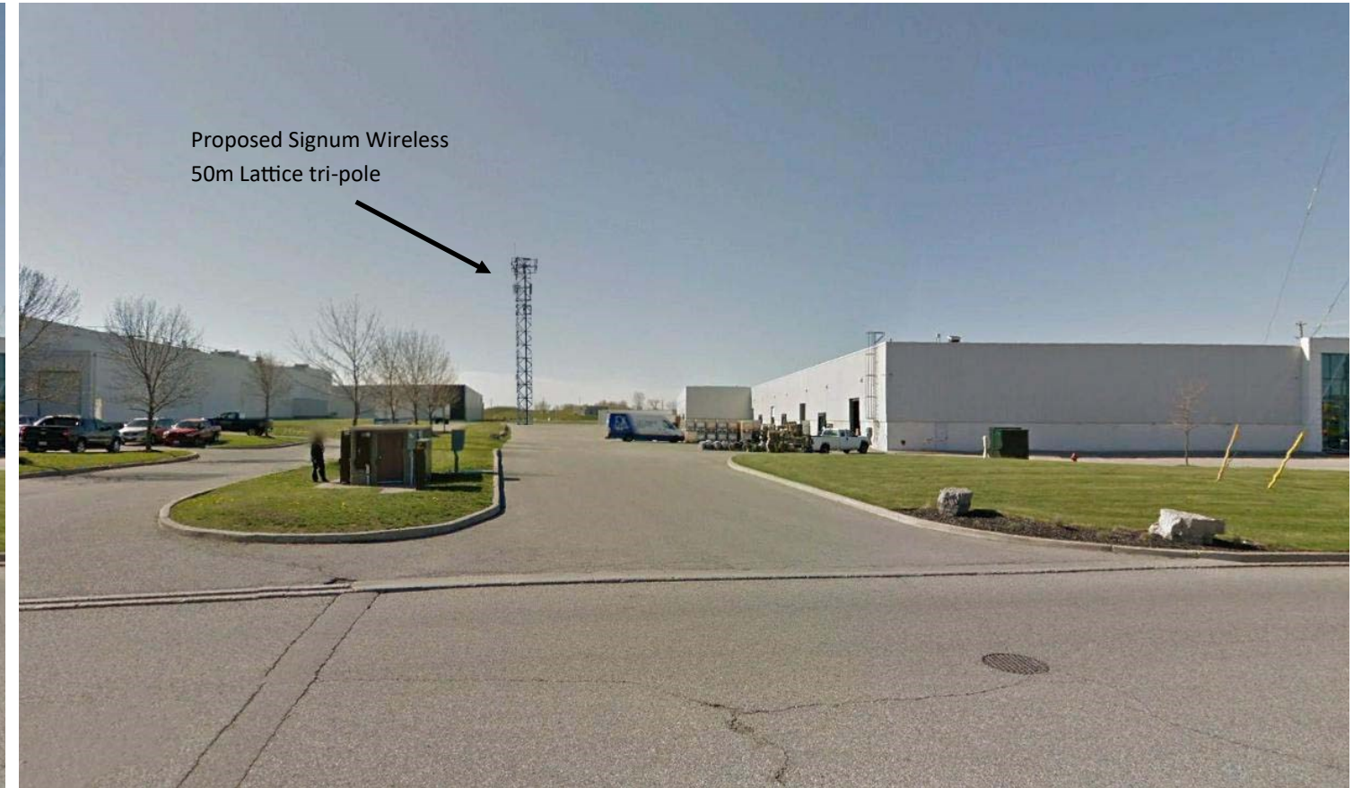
Proposed lattice tripole tower shown at approximately 50.0 metres in height. The photo simulation is based on information provided by Signum prior to construction. The photograph location is approximately 217 metres from tower location.

PHOTOGRAPHIC SIMULATION BEFORE AND AFTER