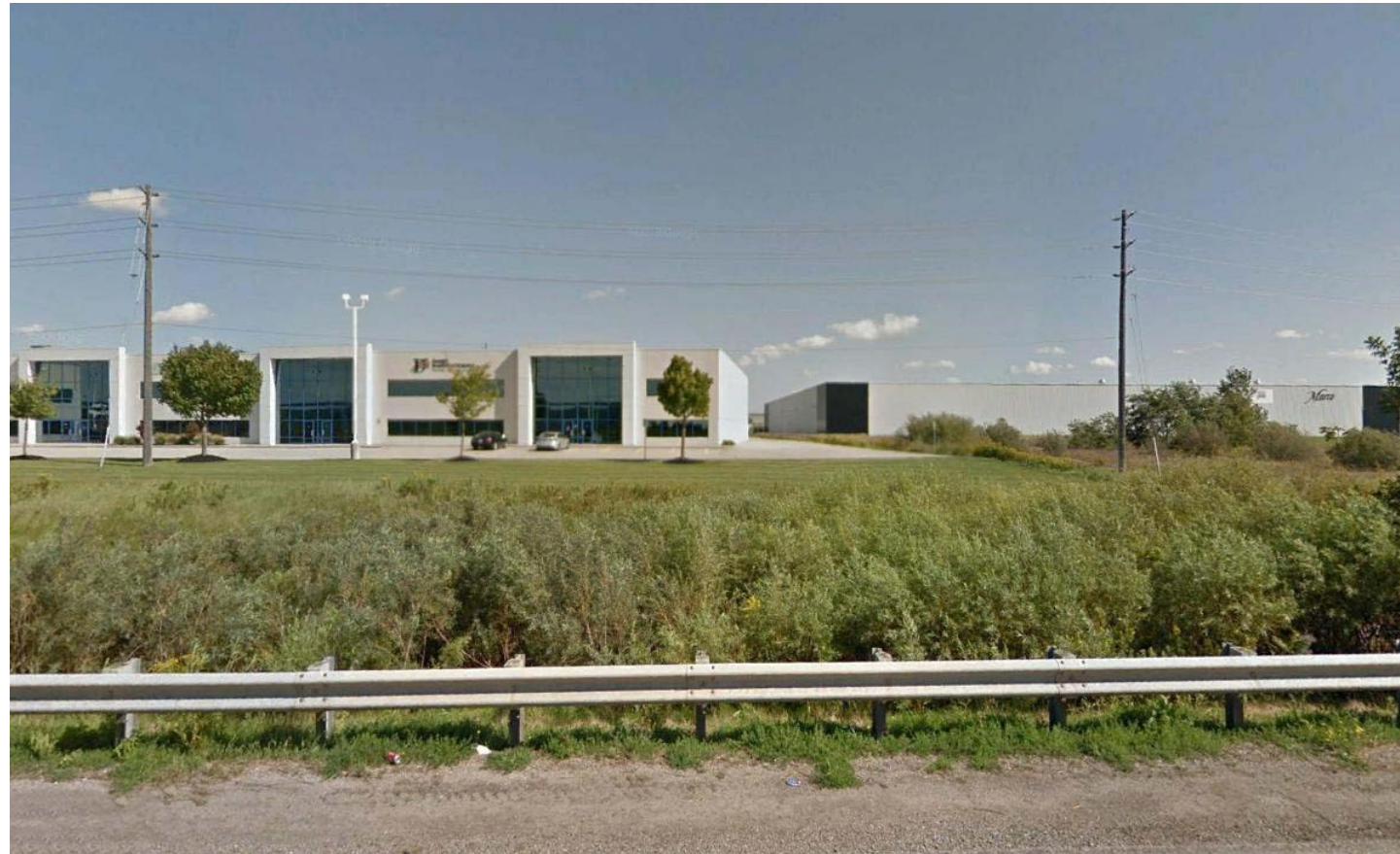
View from Savannah Oaks Drive looking South towards proposed Signum tower.