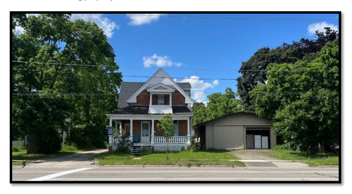
Figure 3 - Streetview of existing property

To the north, south, east and west, the property is surrounded by residential lands, primarily consisting of single-detached dwellings. Along Colborne Street, there are various commercial properties, many of which are auto oriented. The property is within close proximity to amenities including schools, a pharmacy, healthcare services, a grocery store, and public transit stops.