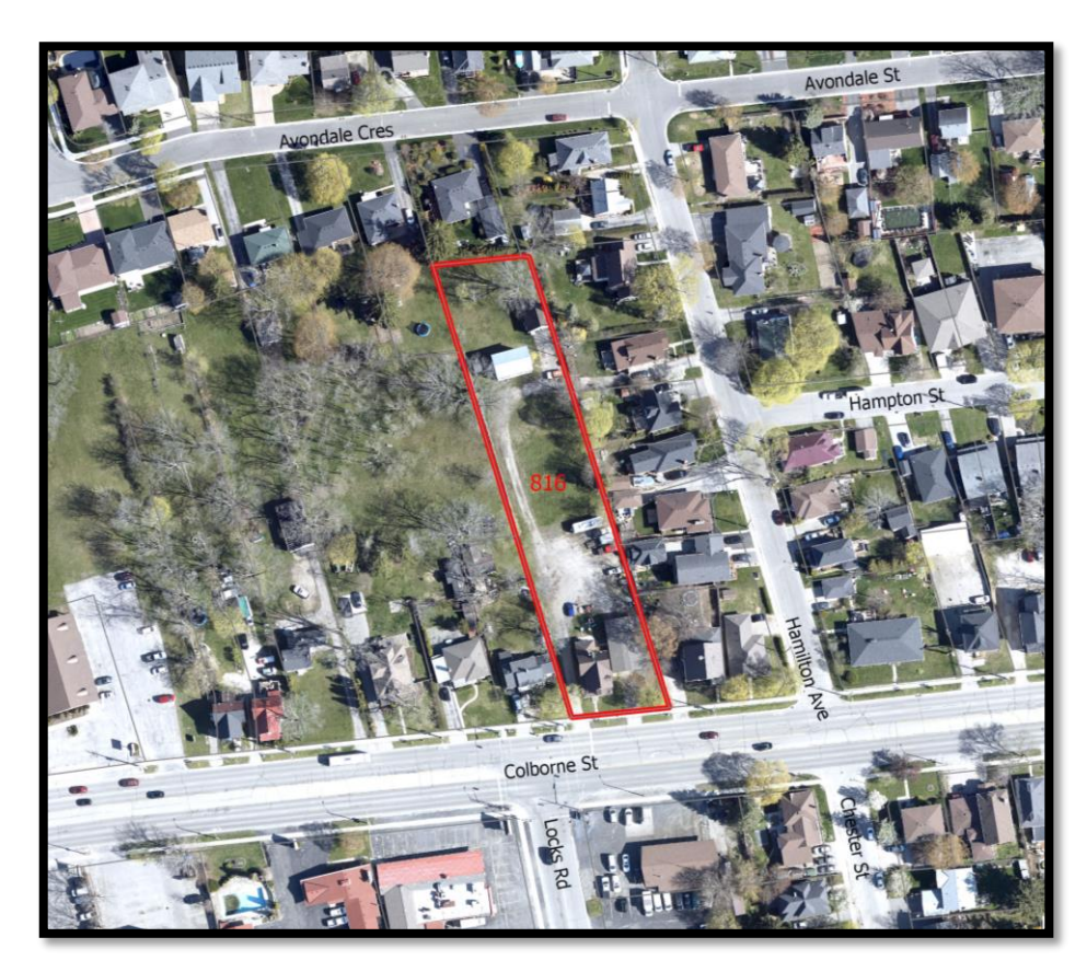
Figure 1 - Aerial Photo