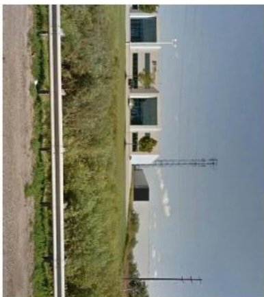
Current Image of Property