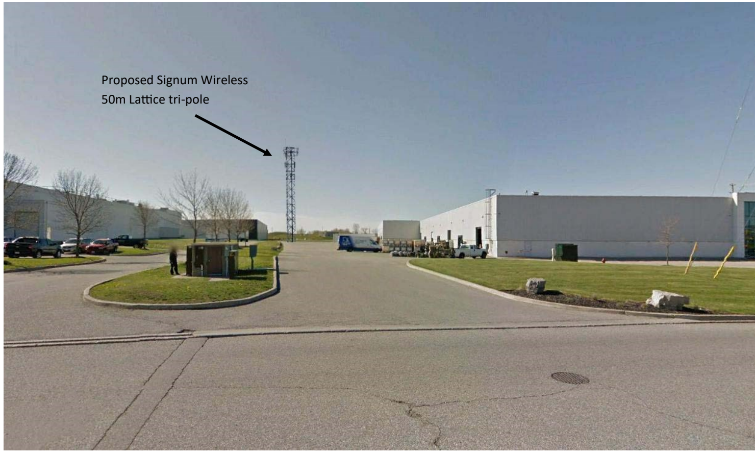
View from Savannah Oaks Drive looking South towards proposed Signum tower.