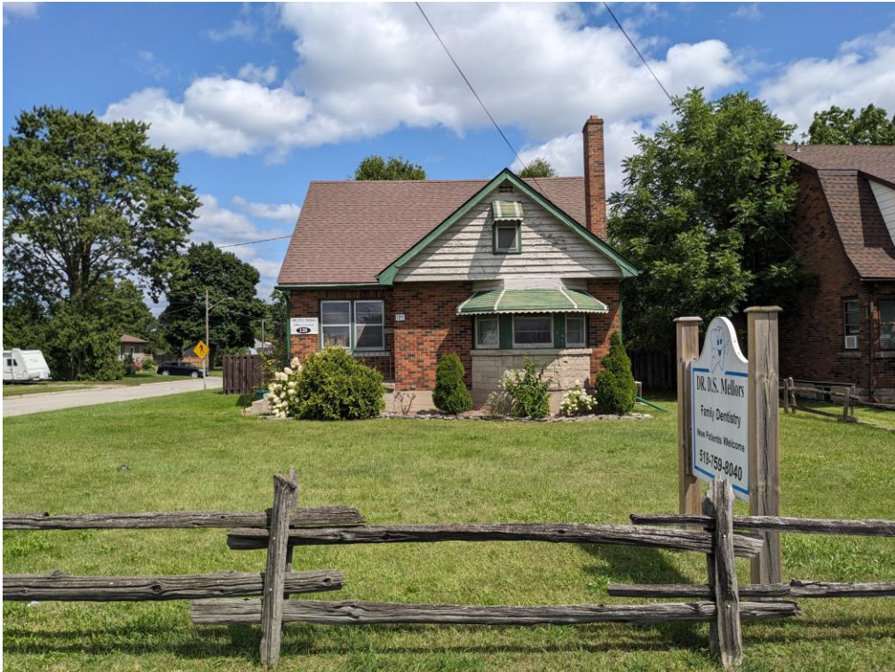
Figure 5: Site Photo taken from Wayne Drive (front of property)