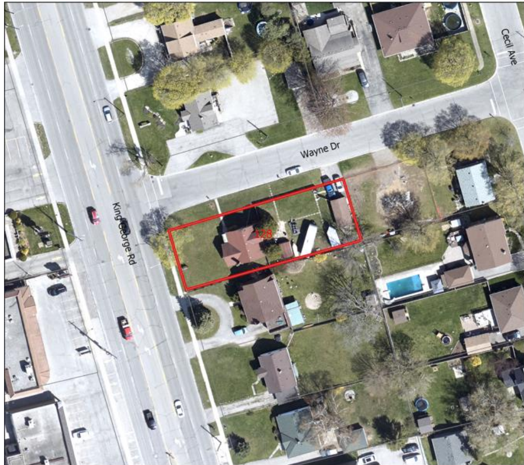
Figure 3: Aerial Photo

The subject lands have a lot area of 962 m 2 (0.24 acres) and a lot width of approximately 18 m. The site is currently occupied by a 1.5-storey single detached dwelling which houses an existing dental office use. The existing driveway off Wayne Drive provides access to the property and associated garage, with on-street parking available for business patrons. An aerial photo is included below in Figure 3 and site photos are included in Figures 4, 5 and 6..