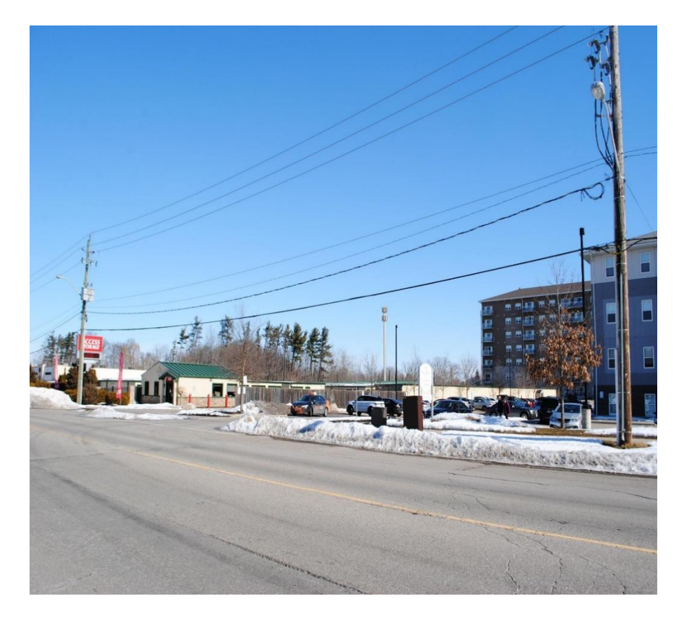
Figure 2 – Photo Simulation