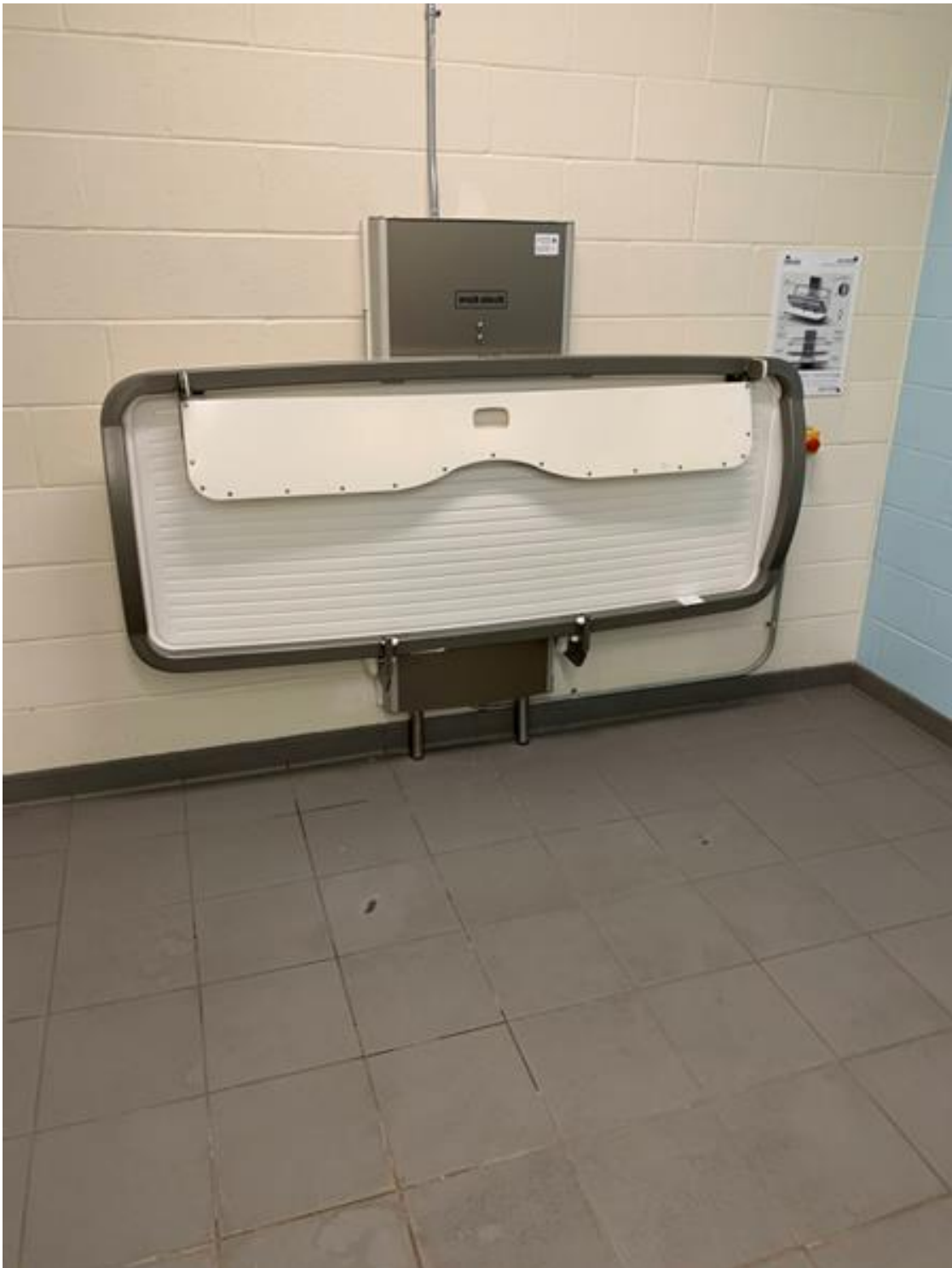
Figure 3 - Photo of New Adult Change Table

The new adult change table and modification to the existing change rooms have been designed with OBC, AODA and FADS design criteria and requirements in mind.