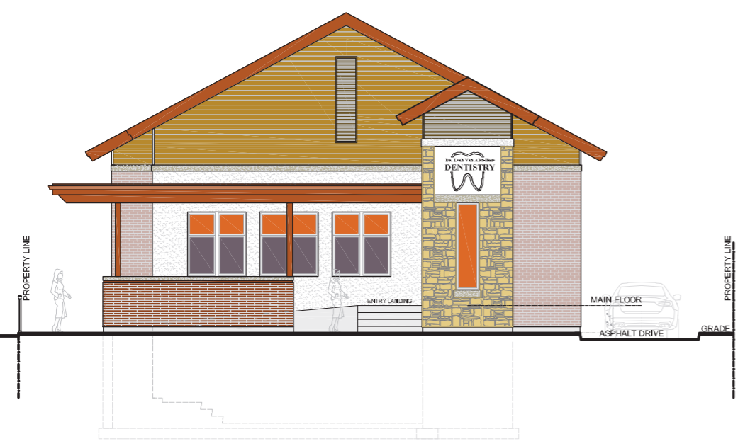
BUILDING ELEVATION - SOUTH