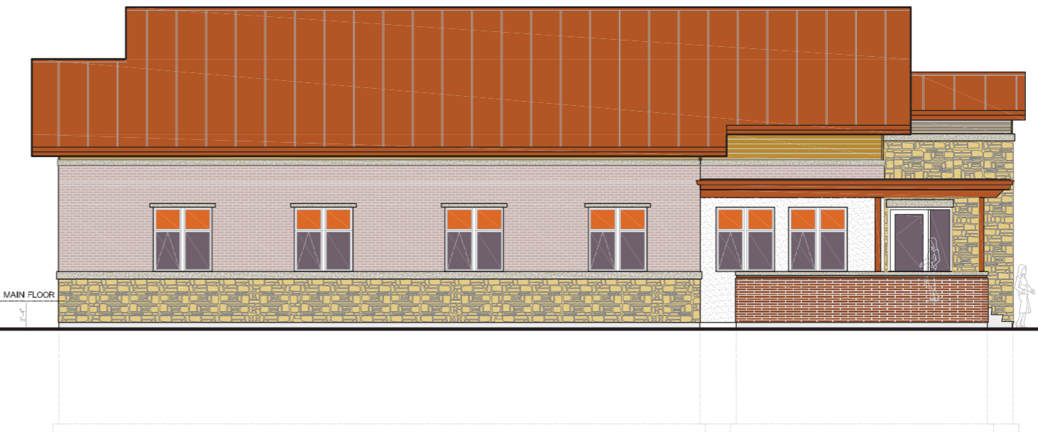
BUILDING ELEVATION - NORTH