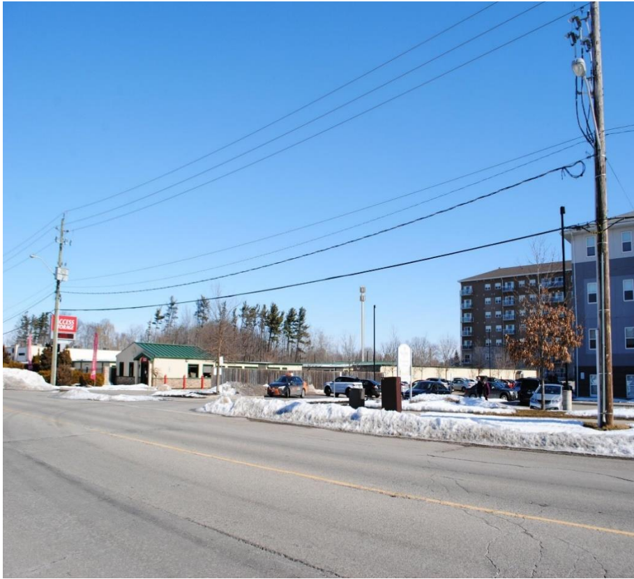
Figure 2 – Photo Simulation