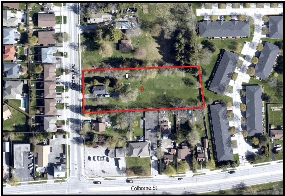
Figure 1 - Aerial of Subject Lands

The surrounding lands consist of low and medium density residential uses primarily in the form of single detached and townhouse dwelling units. The property on the northeastern corner of Garden Avenue and Colborne Street is a mechanic shop with used car sales. Colborne Street also has demarcated bike lanes, as well as access to a public transit stop with services to the Lynden Park Mall, and the inter-city bus station downtown. The lands are designated “Residential” in the Official Plan and Zoned “Residential Medium Density Type A Zone – Special Exception 79 (R4A-79)”, as shown in Appendix C and Appendix D , respectively.