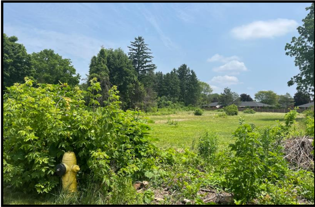
Figure 2 - Streetview of Subject Lands