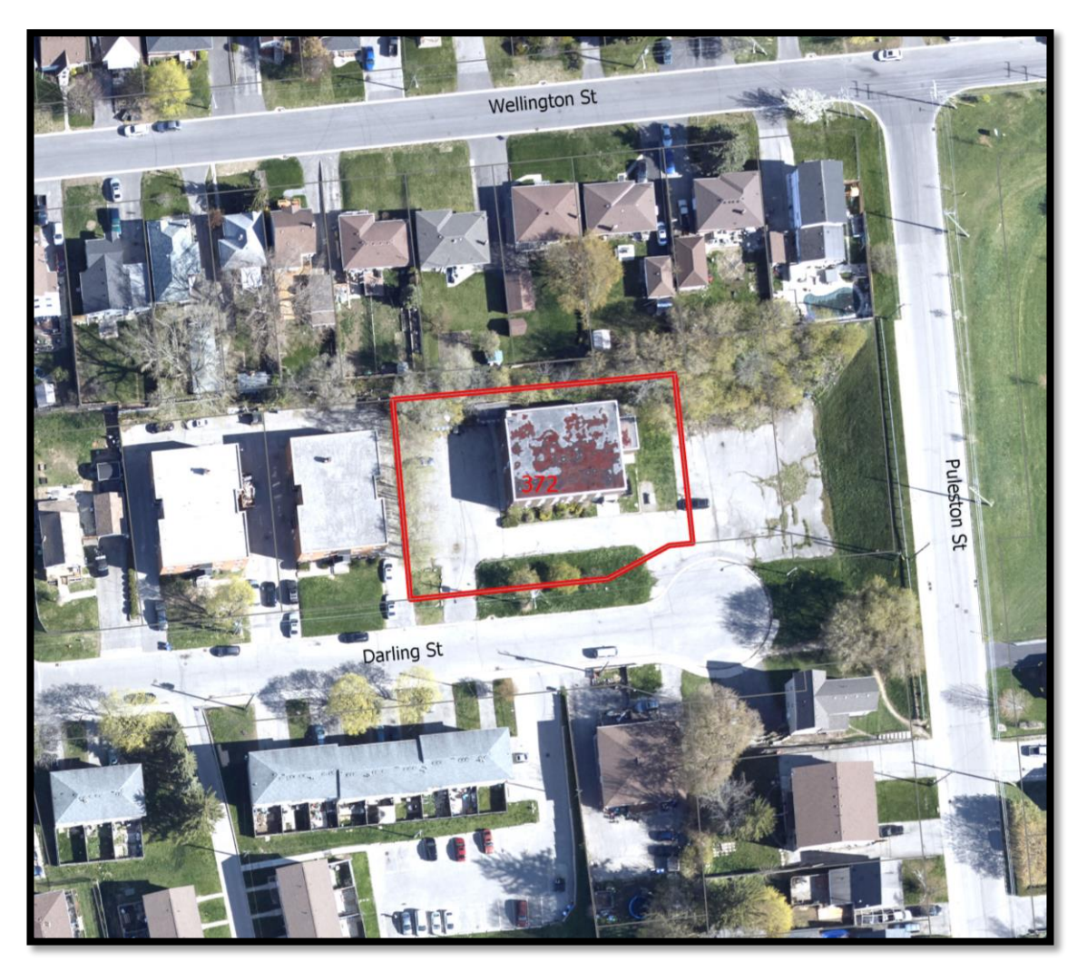
Figure 3 - Aerial of subject lands

Devereux Park is within 70 m of the subject lands. The lands are designated "Residential" in the Official Plan, and zoned "Residential Medium Density Type B Zone – Exception 13" (R4B-13) in the Zoning By-law as shown in Appendix A and Appendix B .