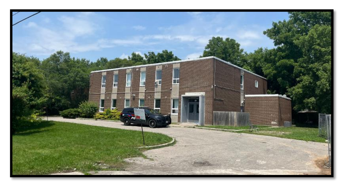
Figure 1 – Existing Apartment Building

A minor variance application has been received for the lands municipally addressed as 372 Darling Street, which has a two-storey apartment building on site, as shown below in Figure 1 . The applicant is proposing some interior changes to the building including the conversion of the existing laundry room and storage room into dwelling units.