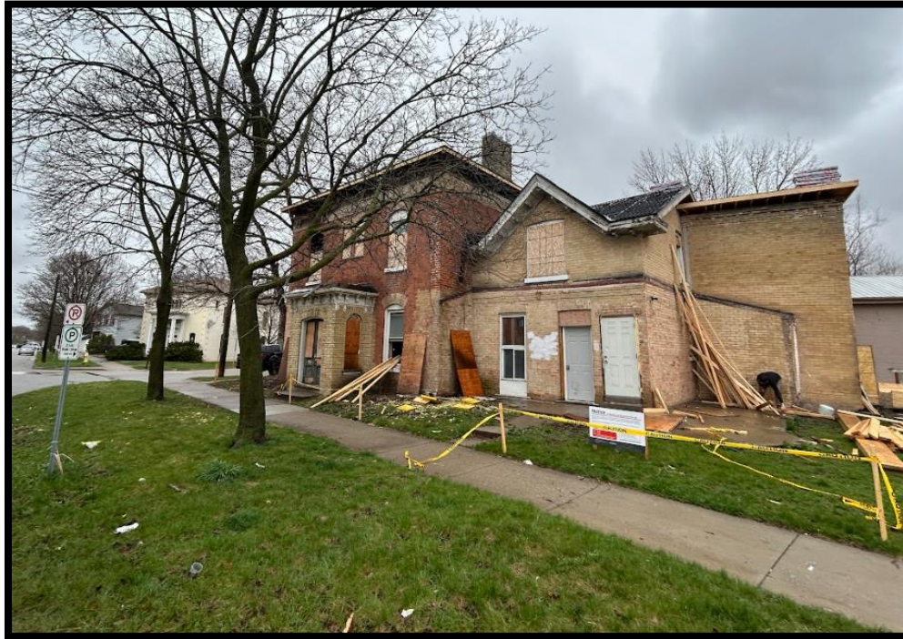
Figure 2 - Subject Lands