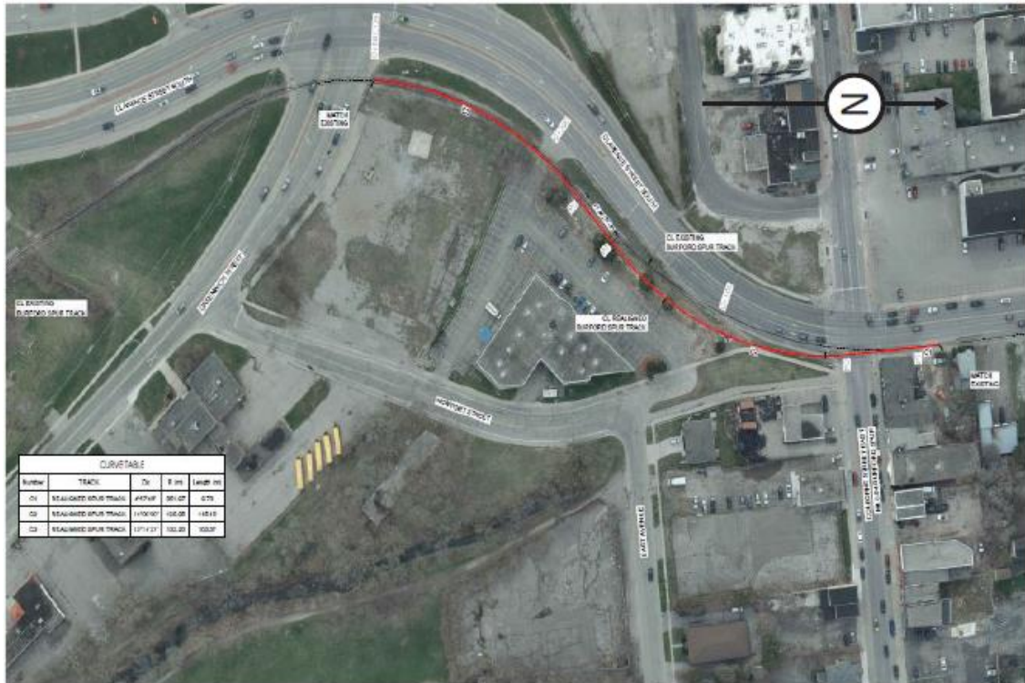
Figure 2 – Option 1

This option will require additional modifications to the existing traffic signals, streetlight poles, hydro pole, sidewalk and curbing. Despite the current flangeway gap and depths meeting Transport Canada’s regulatory requirements, it has been recommended to include a Safety Railseal product called Shallow Flangeway (see Figure 3) in the design and construction of the realignment. This will result in a grade crossing that is safer and easier to for all types of motor vehicles and active transportation based trips.