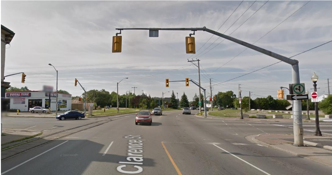
Figure 1 – Clarence Street – Southbound View

This rail line solely supports the product shipments to Ingenia Polymers Corp. (Ingenia). Ingenia “is one of the most trusted thermoplastics providers in the world today, and the preferred supplier to some of the most trusted household brands.” 1 Ingenia was founded in Brantford in 1986 and has expanded worldwide. The rail line is operated twice per week by slow moving shuttle wagon railcars.