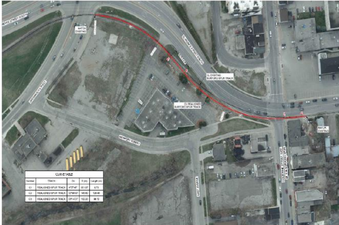
Figure 4 – Option 2

This option will also require the additional modifications to the existing traffic signals, streetlight poles, hydro pole, sidewalk and curbing as with Option 1.