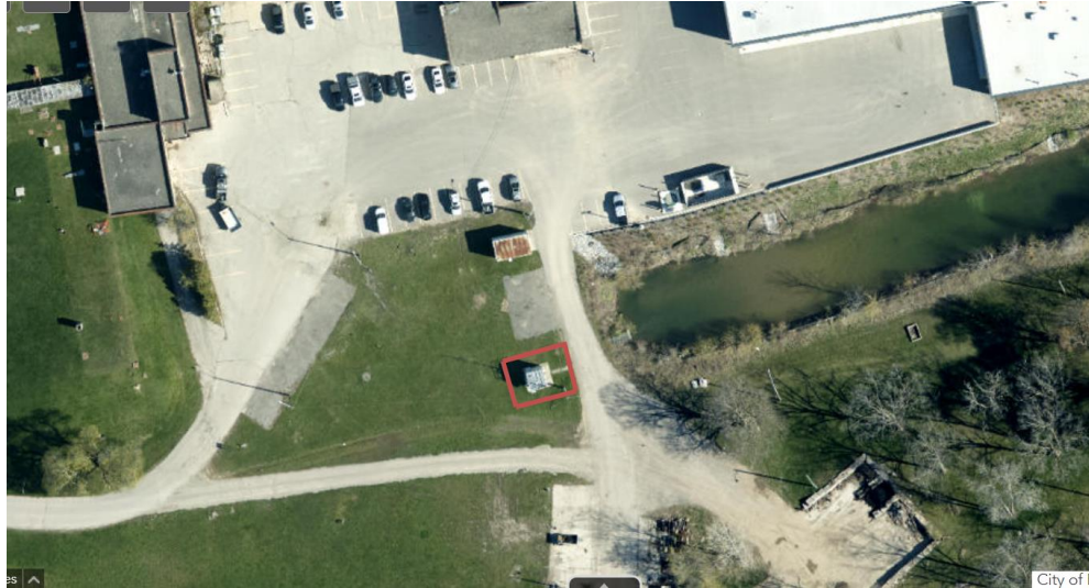
Figure 1: Location of Air Monitoring Station, 324 Grand River Ave.

The Station monitors the air quality in and around Brantford and transmits this information on an hourly basis to Air Quality Ontario. Figure 2 shows the air quality in Brantford on June 28, 2023, when the air quality was poor due the Canadian forest fires burning during that period of time.