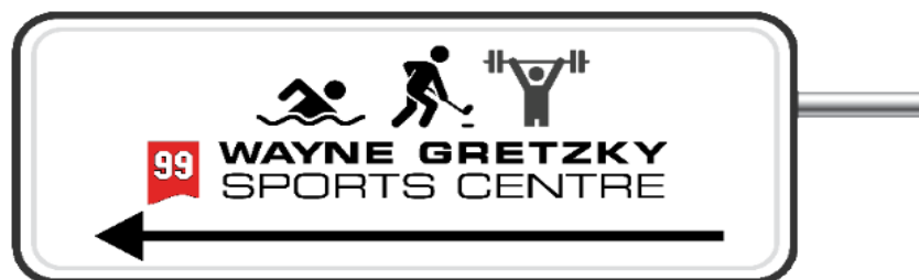
Figure 1 - Wayne Gretzky Sports Centre Overhead Sign

The signs will be approximately 3 feet by 8 feet on vinyl reflective sheeting and illuminated with LED fixtures mounted above the sign. The pole will be installed on the north side of Fairview Drive and the signs will be mounted above the westbound lanes of the street.