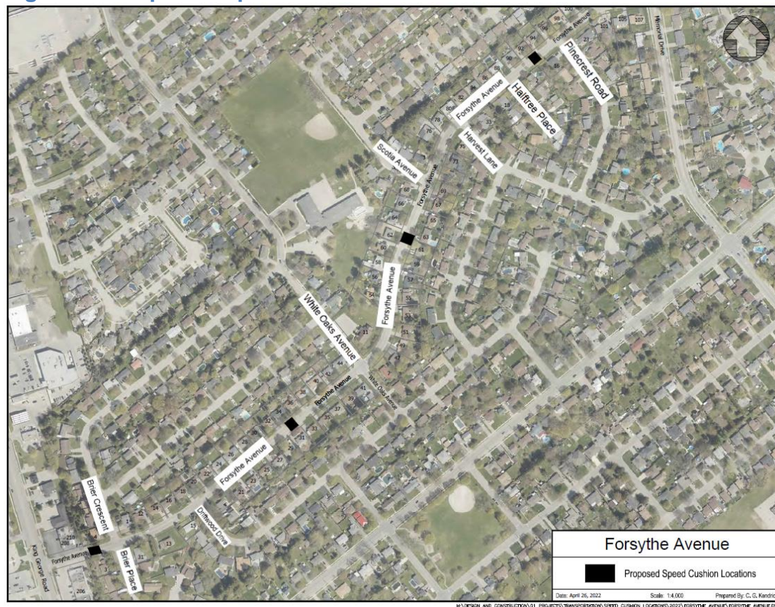
Figure 1 - Proposed Speed Cushion Locations

The temporary speed cushions were installed on Forsythe Avenue in June, 2022. Speed studies conducted with the speed cushions installed revealed an 85 th percentile speed of 45 km/h, an 11 km/h reduction.