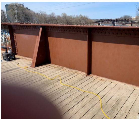
Figure 4: Panels on TH&B Crossing Bridge that have been painted a solid colour (April 2022).

As of April 2022, City of Brantford staff had the inner panels of the bridge painted to cover the extensive graffiti. Prior to the proposed public art project taking place, City staff will ensure that the panels are touched up if required.