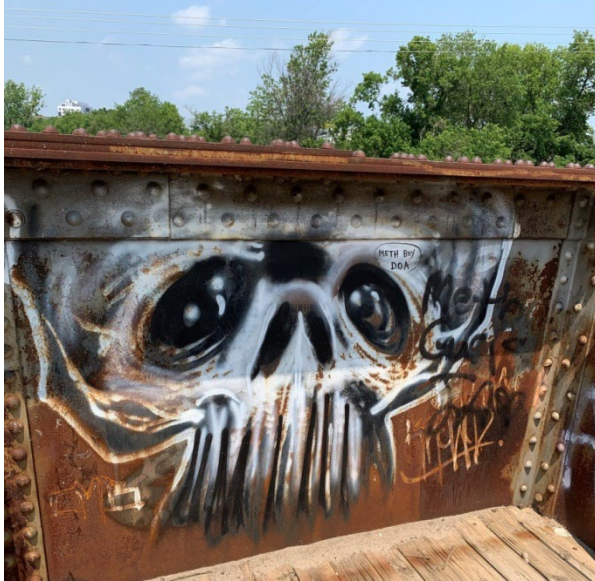
Figure 3: Example of graffiti on TH&B Crossing Bridge panel (Summer 2021).

Areas of the City with public art installations or murals are less likely to be tagged by graffiti. If successful in its efforts to combat vandalism, this pilot project can be used as potential strategy for other parts of the City and trail network that experience vandalism.