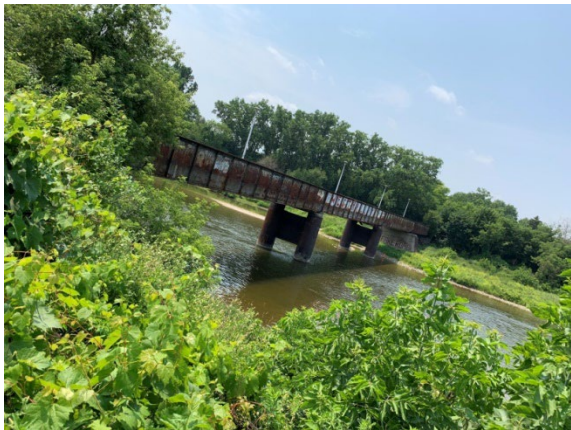
Figure 1: TH&B Crossing Bridge.

In recent years TH&B Crossing Bridge has been subjected to extensive vandalism. The unwanted graffiti that can be seen on the bridge is in some cases inappropriate and does not align with the values of the City.