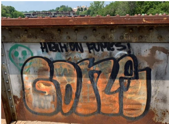
Figure 2: Example of graffiti on TH&B Crossing Bridge panel (Summer 2021)