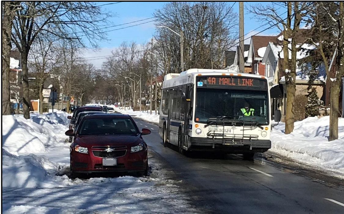
Figure 1 - William Street - Narrow Travel Lane in Winter

Staff do not recommend the removal of the alternate side of street parking restriction. Staff recommend reverting back to 2 hour restricted time limit parking, 9:00 a.m. to 5:00 p.m., Monday to Saturday and time limit exemption permit parking for residents in response to feedback received.